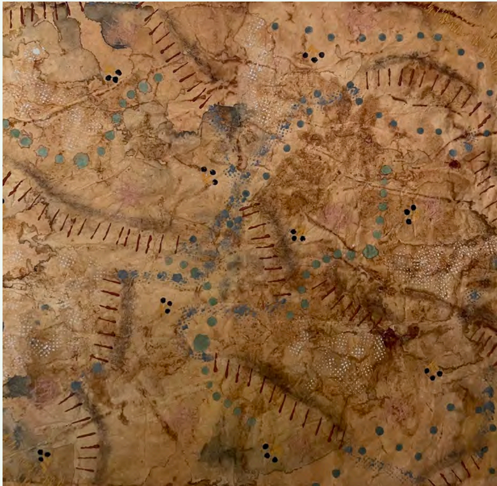
Image: Beverly Smith In the Bush in Country 2025, courtesy of the artist

We acknowledge the Traditional Custodians of the land on which we live, work and play.