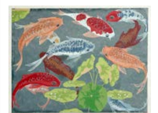
A GLINT OF KOI SIGNIFICANT ARTWORK FROM THE PERMANENT LANDSCAPES COLLECTION

Partnering with the Department of Education, A