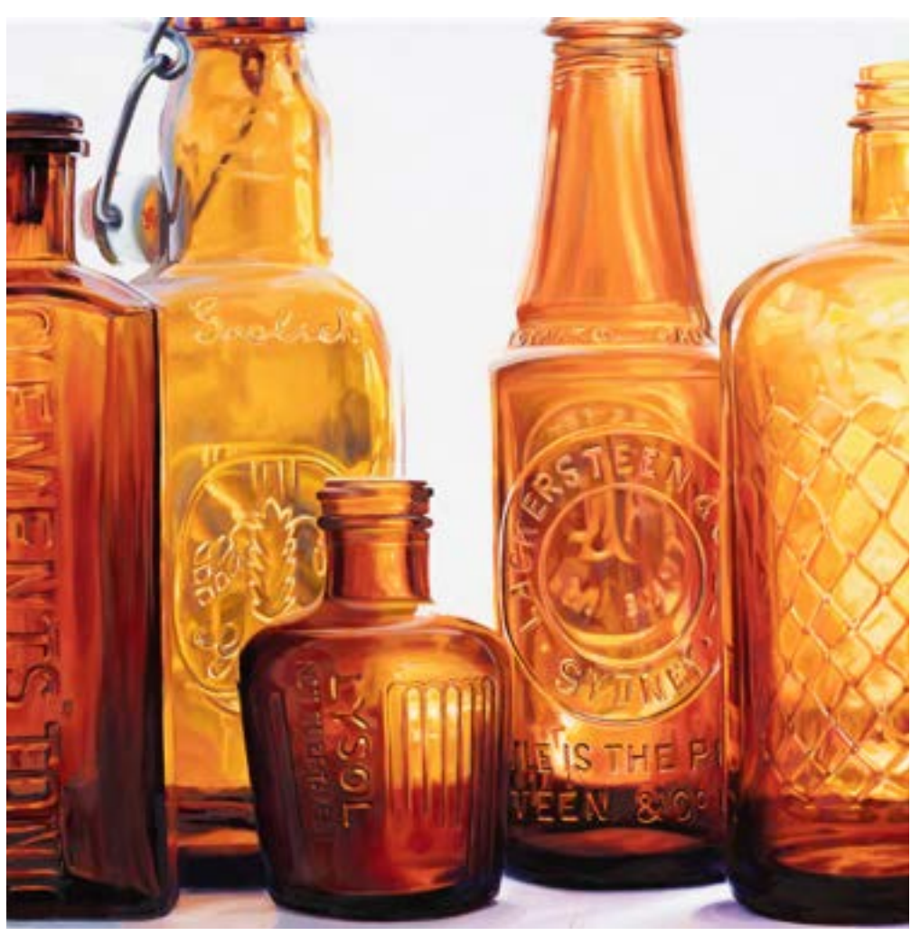
Image: 2022 Gosford Art Prize finalist exhibition, Gosford Regional Gallery.

Entries open on 24 May 2024 and close on 8 July 2024 at 4pm