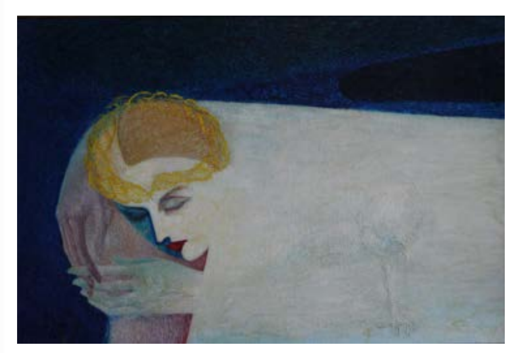
RALPH PODOLSKI A LIFE OF TIME AND CHANCE

We are proud to showcase our program for 2024 and hope you will participate in the many public programs we offer to accompany the exhibitions.