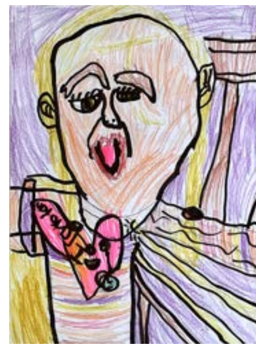
ABOUT FACE 2024 JUNIOR PORTRAIT PRIZE