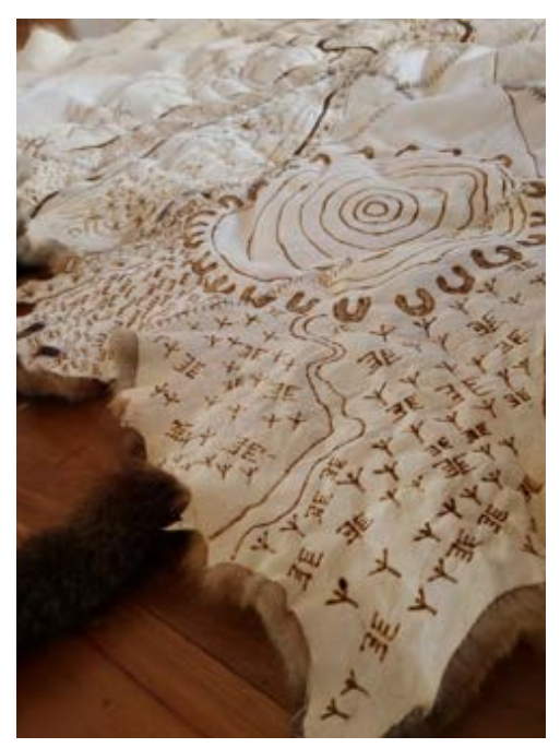
SPEAKING IN COLOUR CULTURAL RESURGENCE